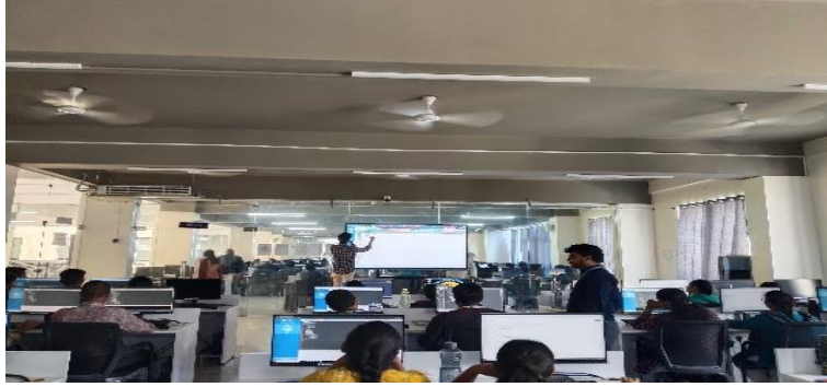
27-04-2024, 1:20 PM – 4:30 PM (ECE & CSG: Room No. 7112)