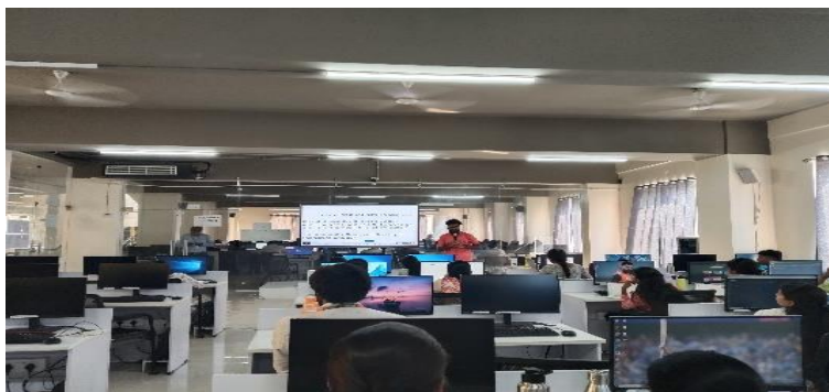
27-04-2024, 9:20 AM – 12:40 PM (CSE: Room No.7111)