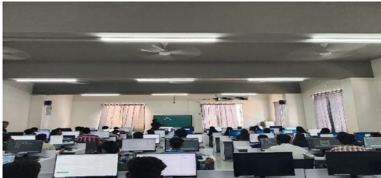
27-04-2024, 1:20 PM – 4:30 PM (ECE: Room No. 7110)