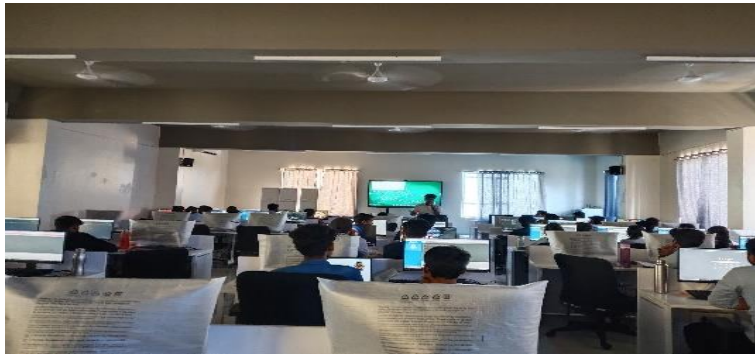
27-04-2024, 1:20 PM – 4:30 PM (AIML & CSM(AIML)): Room No. 7312)