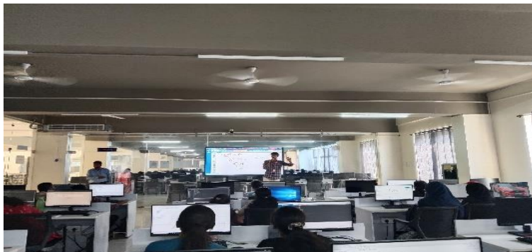
27-04-2024, 9:20 AM – 12:40 PM (CSE: Room No.7112)