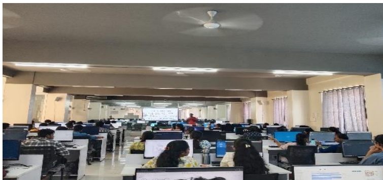
27-04-2024, 1:20 PM – 4:30 PM (ECE: Room No. 7111)