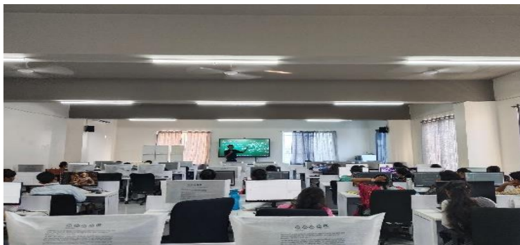
27-04-2024, 9:20 AM – 12:40 PM (IT: Room No.7312)