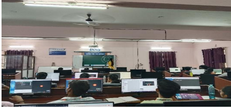
27-04-2024, 9:20 AM – 12:40 AM (IT &CSE: Room No.1012)