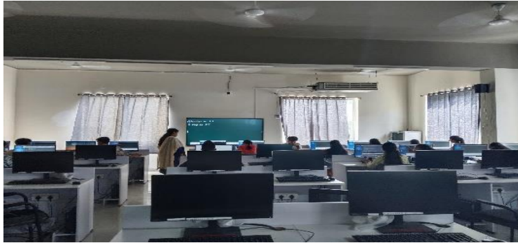
27-04-2024, 9:20 AM – 12:40 PM (AI&DS: Room No.7110)